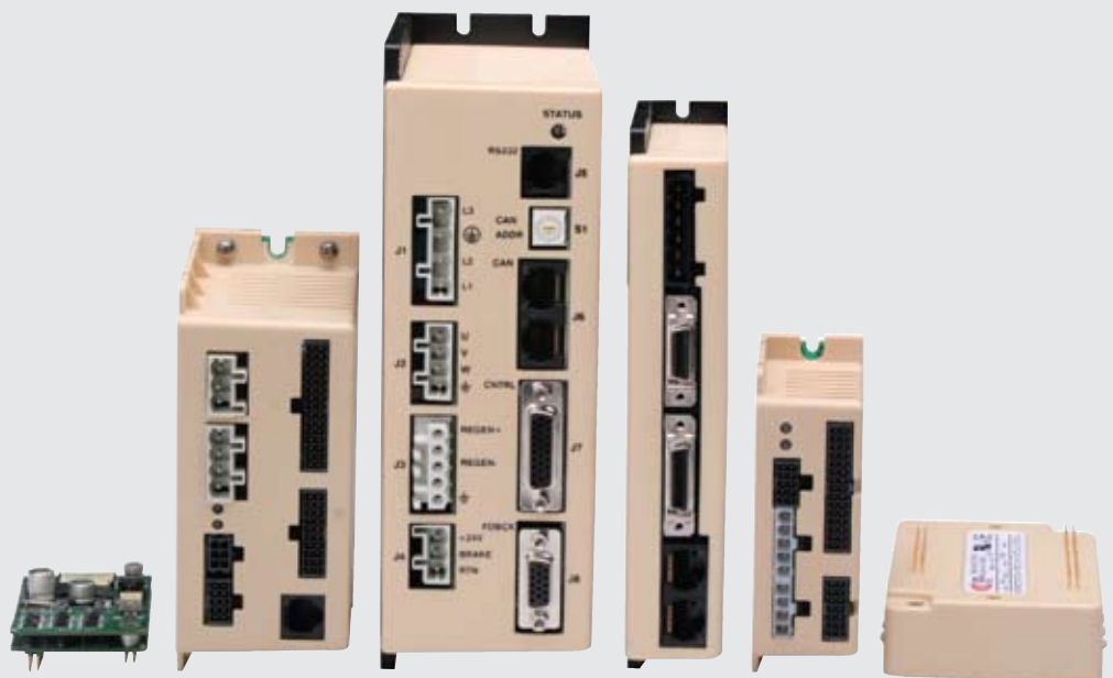
Servo Drives for Harsh Environments